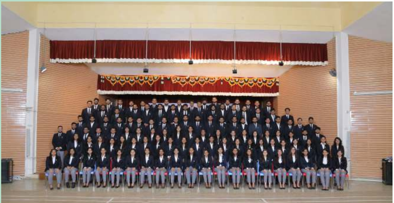
Batch: PGDM 2018-20

Students admitted to the programme are from varied disciplines like arts, commerce, science and engineering. They demonstrate high levels of initiative and energy, capacity for hard work, strong task orientation, willingness to learn, propensity to teamwork, and a passion to excel.