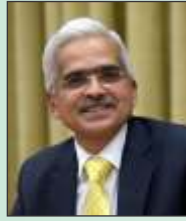
Shri Shaktikanta Das Governor Reserve Bank of India Chairman NIBM Governing Board