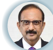
Shri C S Setty Chairman State Bank of India Mumbai

Deputy Governor Reserve Bank of India Mumbai