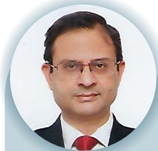
Shri Sanjay Malhotra Governor Reserve Bank of India Chairman NIBM Governing Board

Deputy Governor Reserve Bank of India Mumbai