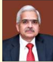
Shri Shaktikanta Das Governor Reserve Bank of India Chairman NIBM Governing Board